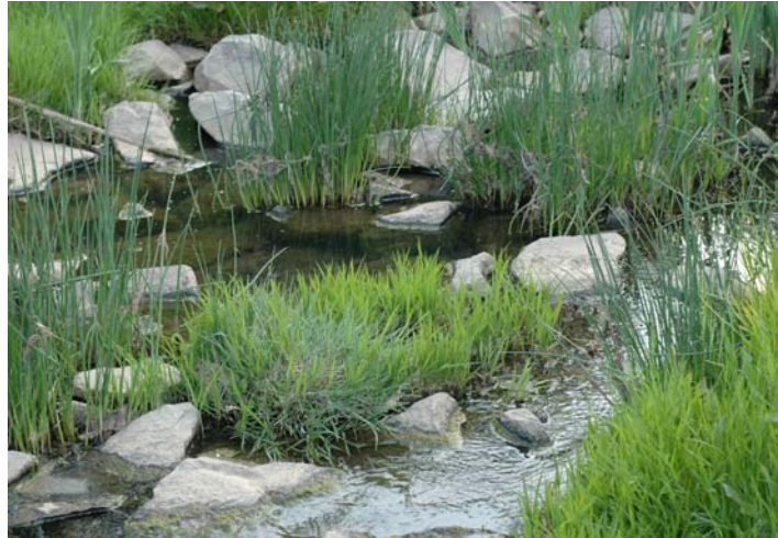
Stream bank stabilization and riparian buffers help maintain water quality.

The Earth Force organization received $4,475 to provide teachers with additional curriculum and supplies to facilitate their students' water-monitoring projects. The teachers participate in the Global Rivers Environmental Education Network (GREEN) to expand their understanding of watershed issues. As part of its grant, Earth Force will receive analytical services from Fairfax Water's water-quality laboratory. Participating classes will compare their water-monitoring results with those of Fairfax Water. Such comparative analysis will provide more detailed water-quality information.